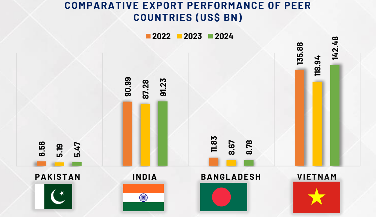
Figure 3 Trend of Export Performance by Selected Countries

Vietnam has emerged as a key trade partner, with exports to the U.S. increasing from $135.88 billion in 2022 to $142.48 billion in 2024, despite a temporary dip to $118.94 billion in 2023. This analysis underscores Pakistan's limited export competitiveness and market share in global trade, particularly when compared to countries like Vietnam and India. The data indicates that Pakistan requires targeted interventions, such as diversifying its export base, improving trade policies, addressing tariff-related challenges, and enhancing supply chain efficiency to remain competitive in the global market. As the United States increasingly adopts protectionist trade policies, Pakistan faces a growing risk of losing price competitiveness. Without strategic diversification, its export portfolio—heavily reliant on textiles and concentrated in the U.S. market—could experience further decline.